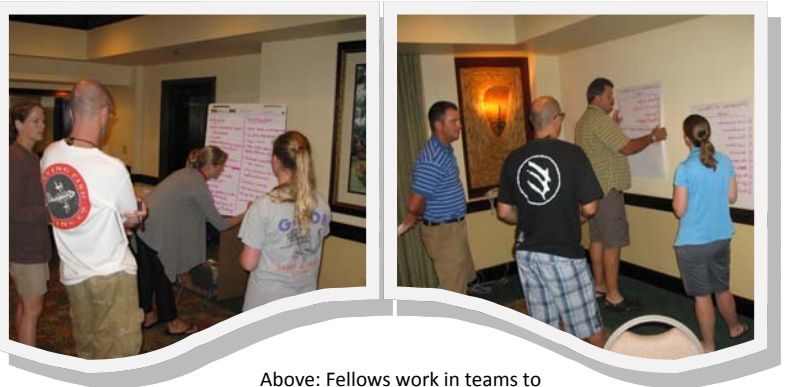
Above: Fellows work in teams to brainstorm effective and ineffective leadership qualities.

Vain and Egotistical Poor time manager Refuses to listen Authoritarian Micromanager Lack of Vision Lack of Integrity